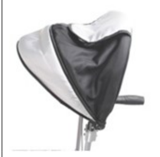
Canopy adaptor included □ Blue □ Pink □ Bordeaux