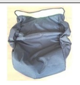
Foot Muff □ Blue □ Pink □ Bordeaux