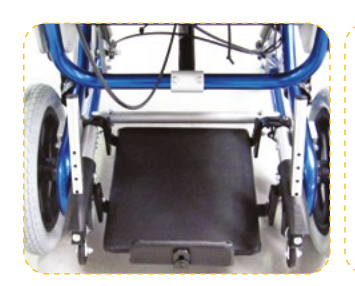
ANTI TIP SYSTEM

WOODEN SUPPORTING BASE FOR BREATHING EQUIPMENT