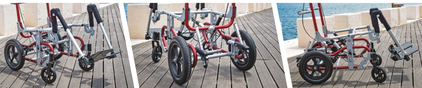
Performing for passion